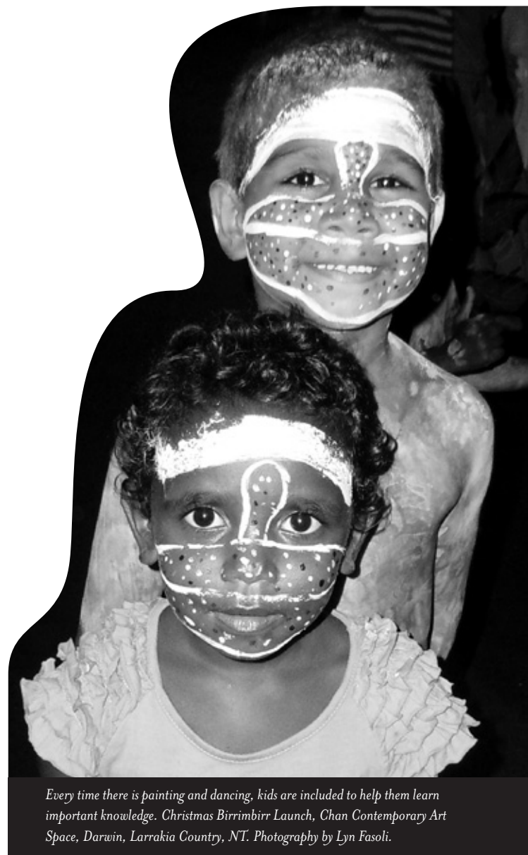
Every time there is painting and dancing, kids are included to help them learn important knowledge. Christmas Birrimbirr Launch, Chan Contemporary Art Space, Darwin, Larrakia Country, NT.

Aboriginal and Torres Strait Islander community controlled child and family organisations undertake these vital cultural interventions with children and their families across the country, often without much fanfare or recognition. Local Aboriginal and Torres Strait Islander community controlled organisations are rooted in their communities, cultures and country. As such, they play a significant role in supporting families and communities to raise children strong in culture. Large national or state-wide non-Indigenous child and family services cannot provide the appropriate support and cultural education to assist Aboriginal and Torres Strait Islander children to reconnect and stay connected